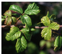
Climbing Poison Oak in Spring

Yet another manifestation of the drought concerns poison oak, harbinger of itchy rashes. If you have been out on More Mesa you may have noticed that our abundant poison oak populations have come up in profusion this year, and this despite the lack of water. You may also be aware that poison oak being deciduous, its leaves normally turn red and die in the fall. However in this fourth year of the drought, the leaves began to turn red in mid June and are already dropping. Because poison oak branches and stems are as dangerous as the leaves (but harder to notice without their famous "Leaves of three, let them be" reminder), all who visit More Mesa need to exercise special caution much earlier in the season ... like now!